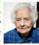
©2017 Emma Anderson Memorial Chapel