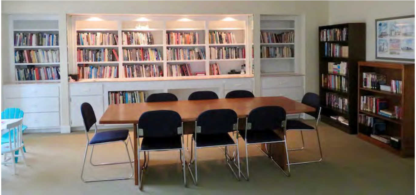
Our well-stocked library also provides a place to hold a meeting. Two comfy chairs in a sunny window offer a comfy place to sit and read.

After much ado— repairs, inventorying, and nine woman-hours of cleaning— in the aftermath of Hurricane Florence last September, the library is all set to reopen on September 1 during its normal hours, Sundays 8:50 - 9:30 a.m. and by request. The library is located in the Fellowship House, 2 nd floor, and is elevator accessible.