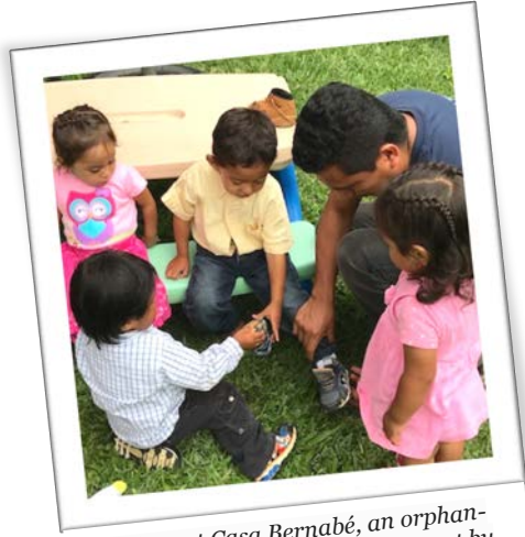
Children at Casa Bernabé, an orphanage in Guatemala, try on shoes sent by Kingdom Crafters.