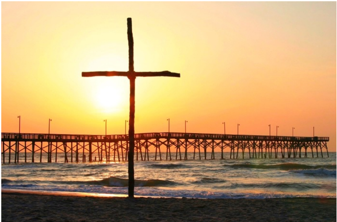
Sunrise service on the beach.